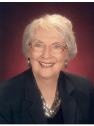
Through My Eyes